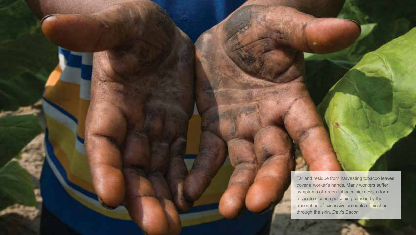
Tar and residue from harvesting tobacco leaves cover a worker's hands. Many workers suffer symptoms of green tobacco sickness, a form of acute nicotine poisoning caused by the absorption of excessive amounts of nicotine through the skin.