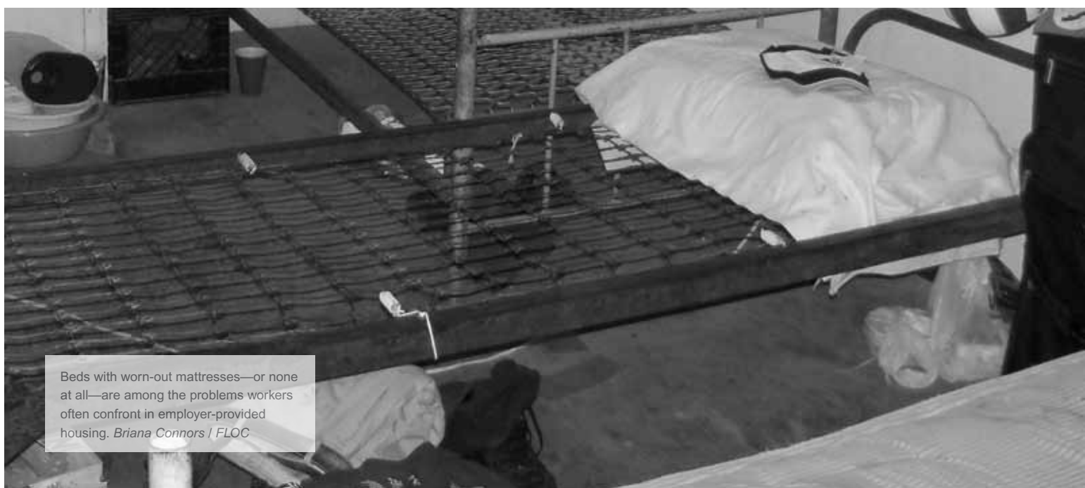
Beds with worn-out mattresses—or none at all—are among the problems workers often confront in employer-provided housing.