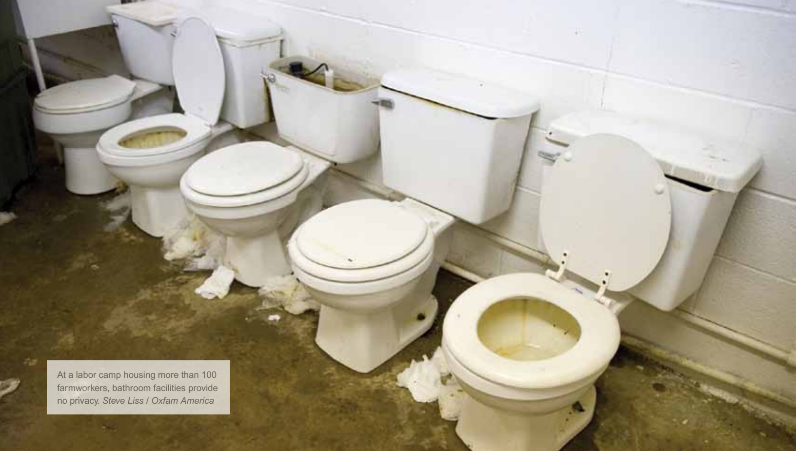
At a labor camp housing more than 100 farmworkers, bathroom facilities provide no privacy.

The NCGA expressed frustration that its members are often held to a higher standard than growers using non-H-2A workers. An NCGA representative said, “I think it all goes back to—just enforce the law uniformly on everybody.” The representative added, “Before you want to try to make me do more, spend more, on my housing, then make everybody meet the same level the H-2A growers are meeting and the existing statutory, regulatory language. Enforce what we got, and then we can talk about moving on. ... You can’t keep laying more and more and more on the guys who are trying to do it right and never enforce it on the guys who never try to do it right. It won’t work. You are going to put the guys who try to do it right out of business.” 67