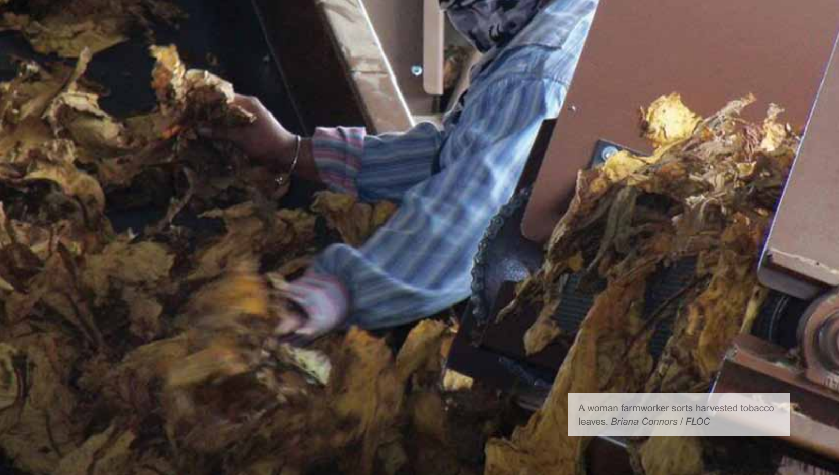
A woman farmworker sorts harvested tobacco leaves.